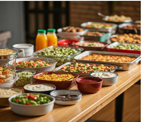
The picture generated by Gemini

Table service and beverages are provided.